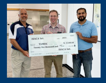
Information Systems Audit and Control Association's (ISACA) Donation

The department of Marketing & Business Analytics (MKTBA) at A&M-Commerce has received a $25,000 scholarship donation from the Information Systems Audit and Control Association's (ISACA) North Texas Chapter.